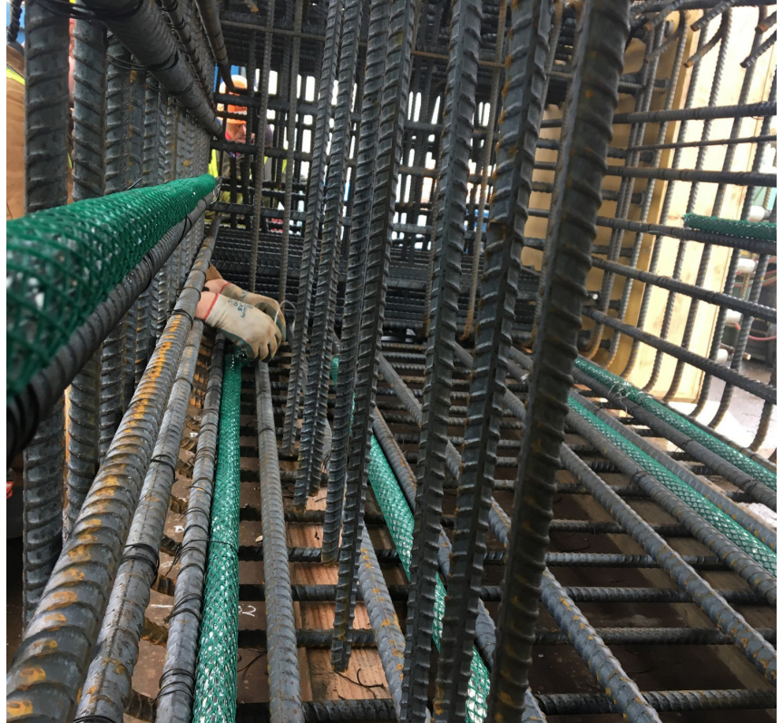
Galvashield® DAS installed into a new concrete beam prior to forming and casting.

Galvashield® DAS distributed anode systems are used for a wide range of applications. Specific application procedures can be developed on a project-by-project basis. For additional information, please contact Vector Corrosion Technologies.