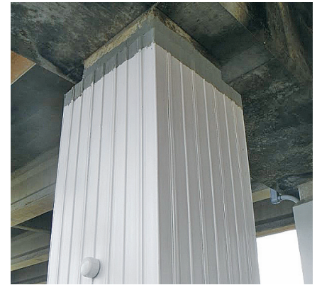
Galvashield Tidal Plus Jacket provides protection to pile sections in the tidal zone and above the splash zone.

The Galvashield Tidal Plus Jacket system with modular formwork is very simple to install, and most work can be completed while the structure remains in service. The system requires no maintenance and restores concrete loss due to steel corrosion and concrete spalling in one operation. Galvashield Tidal Plus Jackets can be round or square and care available in custom lengths which can be modified in the field to suit project conditions.