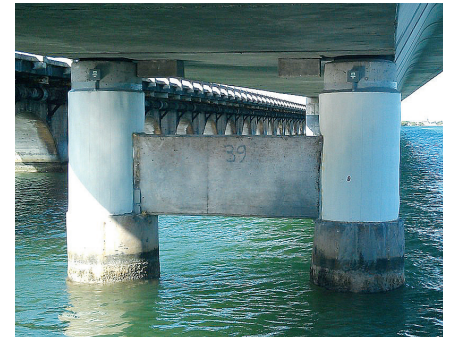
Galvashield DAS Jackets provide protection to pile sections above the tidal zone.

The Galvashield DAS Jacket system, with its modular formwork, is very simple to install and allows most work to be completed while the structure remains in service. The system requires little or no maintenance and restores concrete loss due to steel corrosion and concrete spalling in one operation. Galvashield DAS Jackets can be round or square and can be supplied or modified on site to suit project conditions.